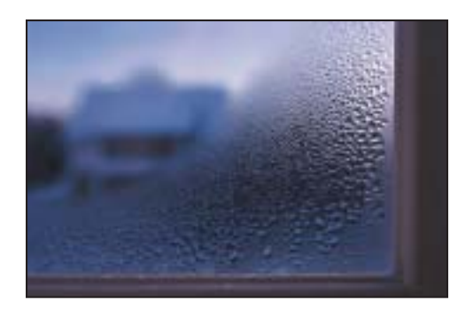
Condensation on the inside of a windowpane.